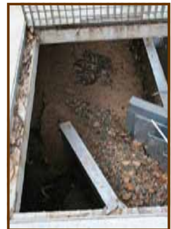
Above: Baramy Trap to catch sediment.