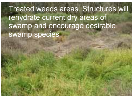
Treated weeds areas. Structures will rehydrate current dry areas of swamp and encourage desirable swamp species