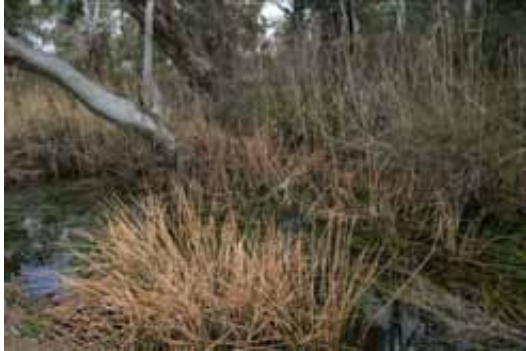
Intact swamp and wetland systems

- hydrological management and weed control