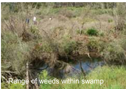
Range of weeds within swamp