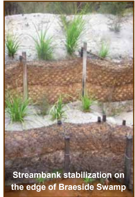
Streambank stabilization on the edge of Braeside Swamp

The structures created a trajectory of change that favoured swamp vegetation over the exotic grasses and resulted in spontaneous natural regeneration of swamp vegetation with very little intensive bush regeneration or planting being required. The soft engineering solution provided a cost effective and long term solution to a previously open ended and labour intensive struggle with exotic weed grasses.