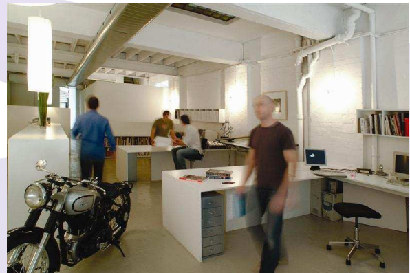
AVL's Studio in Camperdown

With no installation of expensive equipment, AVL made significant cuts to their energy use and greenhouse gas emissions while cutting their business running costs.